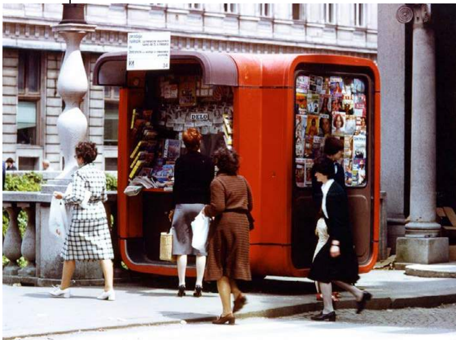
Kiosk K 67

I would like to thank to all the member organisations of the Future Architecture platform for their cooperation and support in establishing the platform and also for presenting a very interesting programme of activities in the first year of operation. In particular, I would like to thank all the participants who, with their applications,