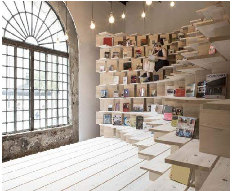
Slovenian Pavilion presented by the MAO at the Venice Architecture Biennale 2016

that, we are increasingly convinced that the distinction between the past, present and future in architecture is an outdated illusion. We believe that in an institution that deals with architecture history, the present and the future should coexist and there should be no question of priorities related to time. The spaces we live in are shaped by historical and contemporary architecture whilst at the same time being constantly subjected to thinking, planning and the developing of projects for the future.