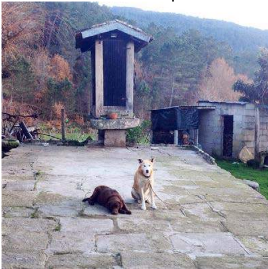
Above: Hórreo in Valongo, Galicia, Spain.