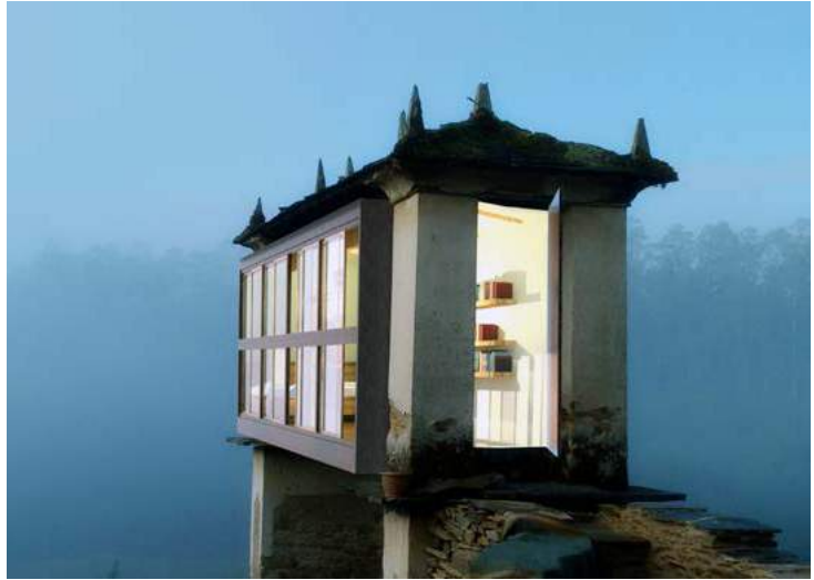
Repaired and glazed hórreo .

harvest is no longer done in hórreos with these large companies using vast storage buildings instead. Hence the abandonment of the hórreos to the rain, freezing winter temperatures and strong winds that reduce these heritage structures to heaps of rubble in the mountains.